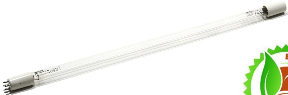
Ozone Producing Replacement Lamp