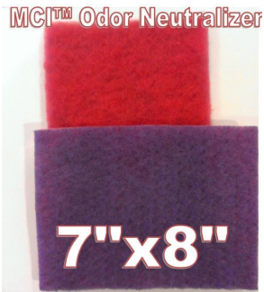
MCI™ Odor Neutralizer Replacement Filters

http://www.BLSPro.com/ _____ Insert Service Provider #